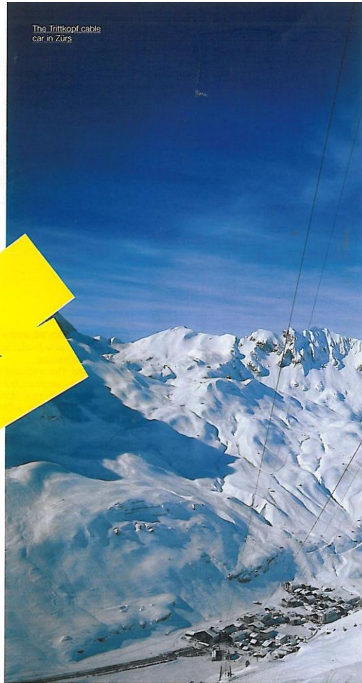
The Trittkopf cable car in Zürs

Louisa stayed at the 4* Hotel Arlberghaus in Zürs; seven nights from £1,703 per person or three nights from £1,000 per person (based on two sharing), including accommodation on a half-board basis, return flights from London, return transfers and resort service. For booking and enquiries, please call the Powder Byrne team on 020 8246 5300 or visit www.powderbyrne.com .